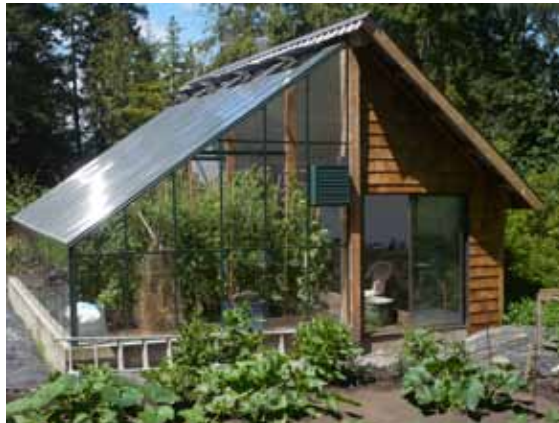
Examples of lean-to (left), or gable-attached (below) designs.

Cross Country Greenhouses offers several glazing options with a home-attached greenhouse which includes single tempered glass, twinwall and five-wall polycarbonate as well as double glass. Glazing options can be intermixed to optimize your additional growing or living space.