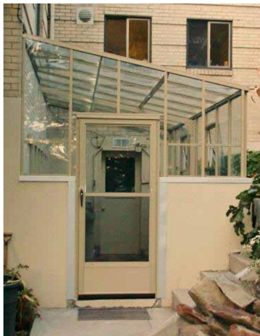
A walkout basement is a common entry for a home-attached greenhouse.

Our greenhouses are designed to install to the outside surface of an existing building and that could be siding, stucco, wood shakes or brick/ stone. We are frequently asked if the attaching wall will degrade faster than the other exterior walls of the building. In our experience, the temperature inside the greenhouse is a more controlled environment in terms of temperature and humidity and as such, the wall will not degrade as fast due to fewer fluctuations. People also ask if the extra humidity will cause rot or mould due to increased condensation. Increased condensation will be a problem for your wall and also harmful for your plants. Condensation can be easily controlled so that is not the case using standard ventilation procedures.