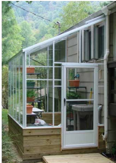
The attached greenhouse below has a four foot infill area to seal to the attaching wall.

Will you require a special section for an in-fill? We can extend the glazing wall to be flush with the side of your house/ building in cases where we attach to the outer fascia of your roof overhang. .