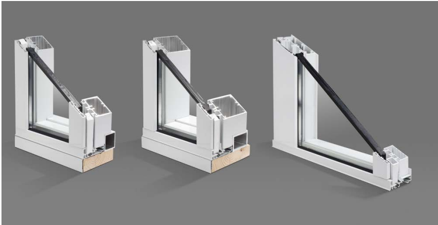
Luxury Bar 3