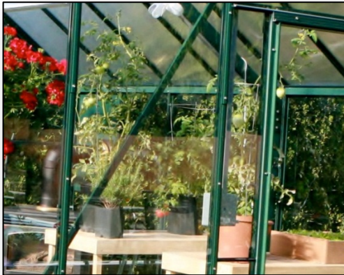
Close up of greenhouse without pressure cap showing exposed hardware

Greenhouses that incorporate the decorative pressure cap are upgraded to single; one-piece 6mm tempered safety glass to ensure the pressure cap is a seamless fit. This single sheet of glass provides a substantial and streamlined design.