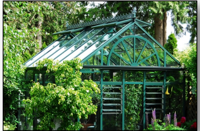
Greenhouse with Decorative Pressure Cap

What is a decorative pressure cap? It is a wider profile aluminum beauty cover that gives the look of a more substantial structure (glazing bar) without the cost. Our standard hobby glazing bars have exposed screws and hardware where the decorative pressure cap (also called beauty cap) creates a high style, clean finish that is very popular with homeowners who would like a garden conservatory in their yard and prefer a more finished trim.