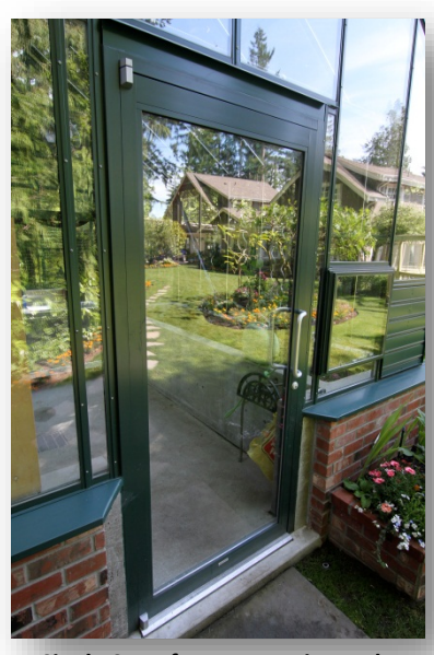
Single Storefront Door Pictured -Double doors also available

If the greenhouse is part of the overall security envelope of your home, this fully assembled professional aluminum door is insulated with tempered safety glass and durable keyed deadbolt lock. Every door comes with your option of custom color and finish, door pulls, hardware, and panic bars.